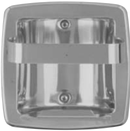
Shown with Bright Finish Model 823B